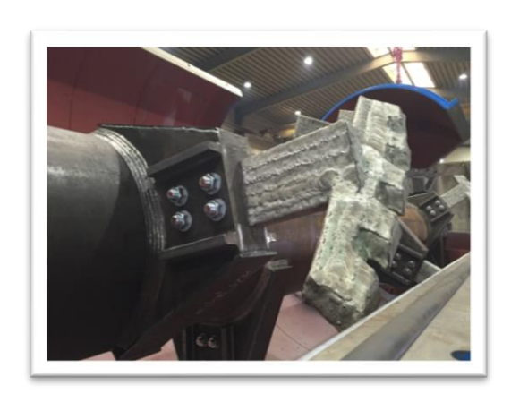
Figure 4: AVA Heavy-Duty Blades with Tungsten Carbide Coating