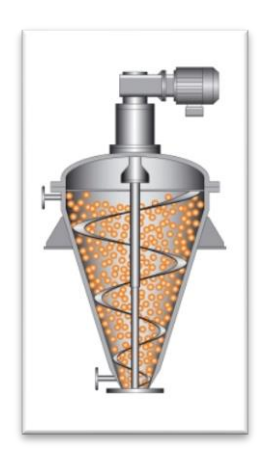
Figure 1: Vertical Cone Mixer